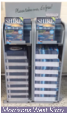
Morrisons West Kirby